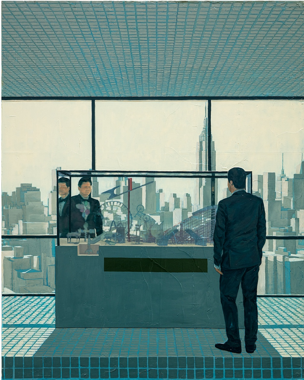
Ho Jae Kim Day 13: Map of the World 2023 Oil, inkjet transfer, enamel, and paper on canvas 50h x 40w in 127h x 101.60w cm