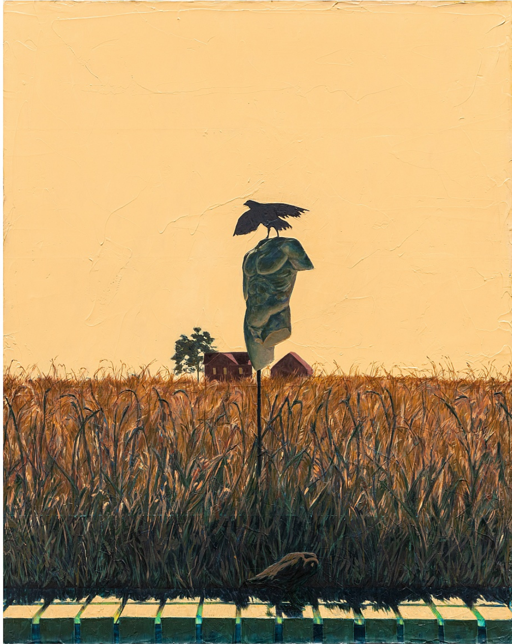
Ho Jae Kim Day 4: Scarecrow 2022 Oil, inkjet transfer, enamel, and paper on canvas 50h x 40w in 127h x 101.60w cm