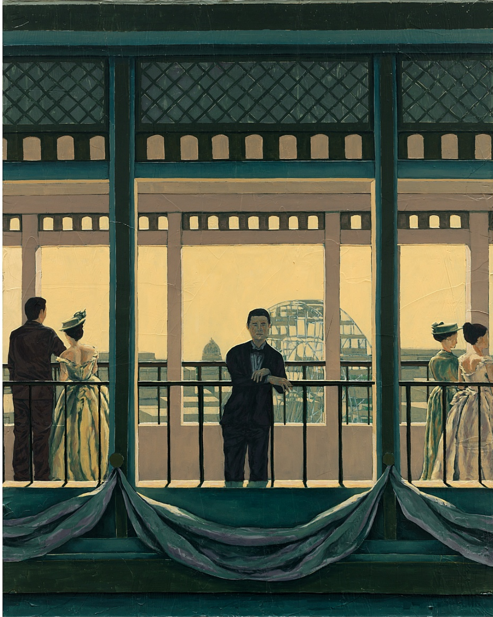
Ho Jae Kim Day 2: The White City 2022 Oil, inkjet transfer, enamel, and paper on canvas 50h x 40w in 127h x 101.60w cm