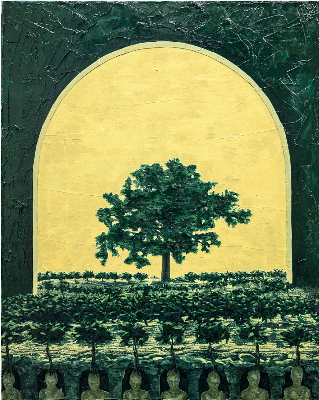
Ho Jae Kim Day 7: Planted Man 2023 Oil, inkjet transfer, enamel, and paper on canvas 50h x 40w in 127h x 101.60w cm