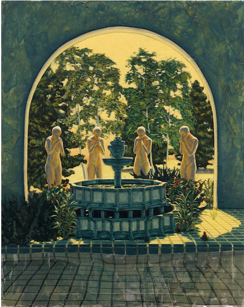
Ho Jae Kim Day 12: Fountain 2023 Oil, inkjet transfer, enamel, and paper on canvas 50h x 40w in 127h x 101.60w cm