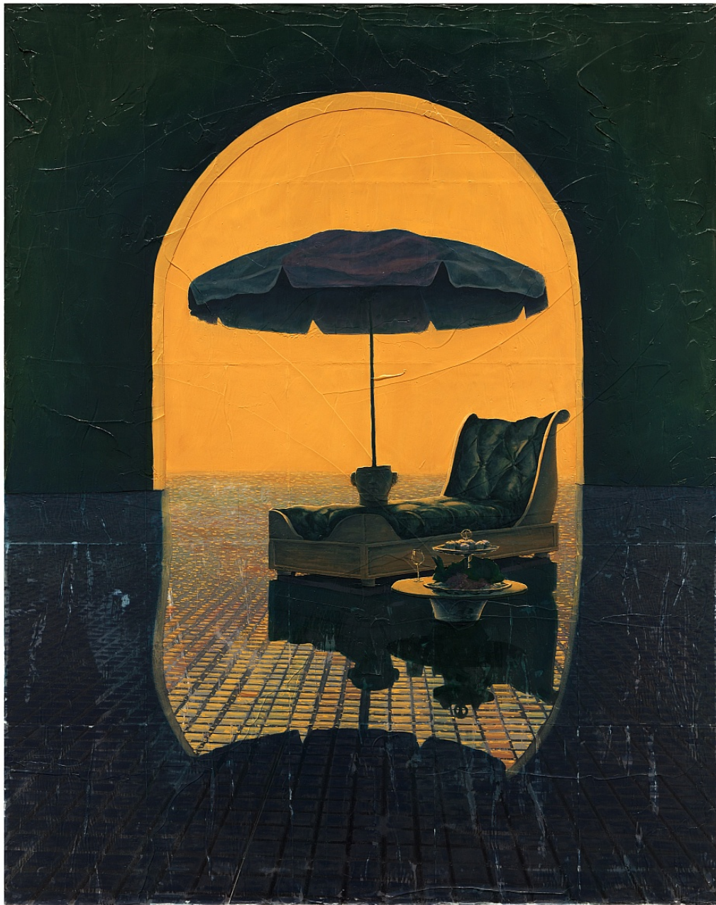
Ho Jae Kim Day 16: Therapy 2022 Oil, inkjet transfer, enamel, and paper on canvas 50h x 40w in 127h x 101.60w cm