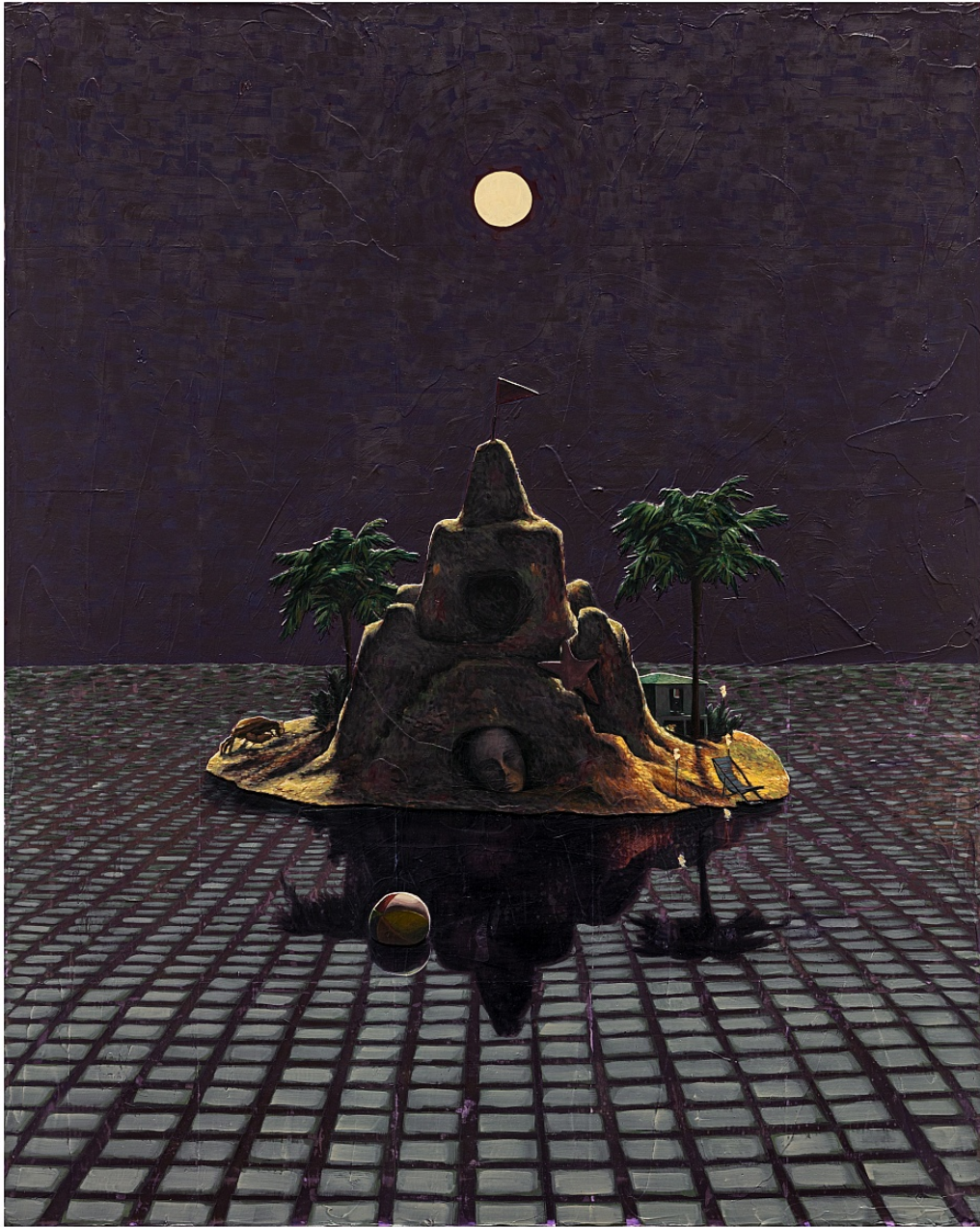
Ho Jae Kim Day 6: Buried 2023 Oil, inkjet transfer, enamel, and paper on canvas 50h x 40w in 127h x 101.60w cm