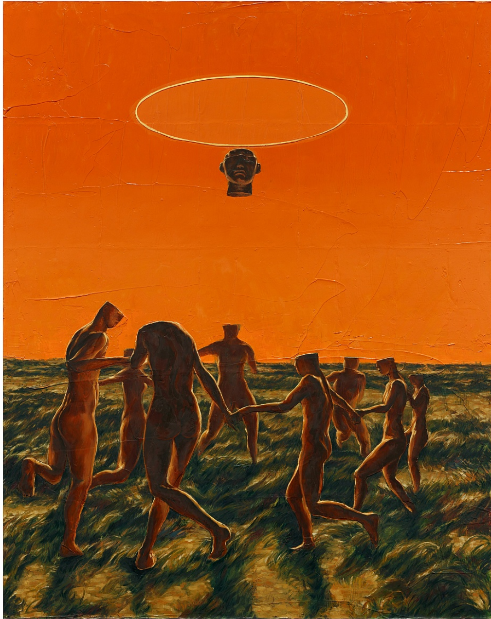
Ho Jae Kim Day 9: Dancers 2023 Oil, inkjet transfer, enamel, and paper on canvas 50h x 40w in 127h x 101.60w cm