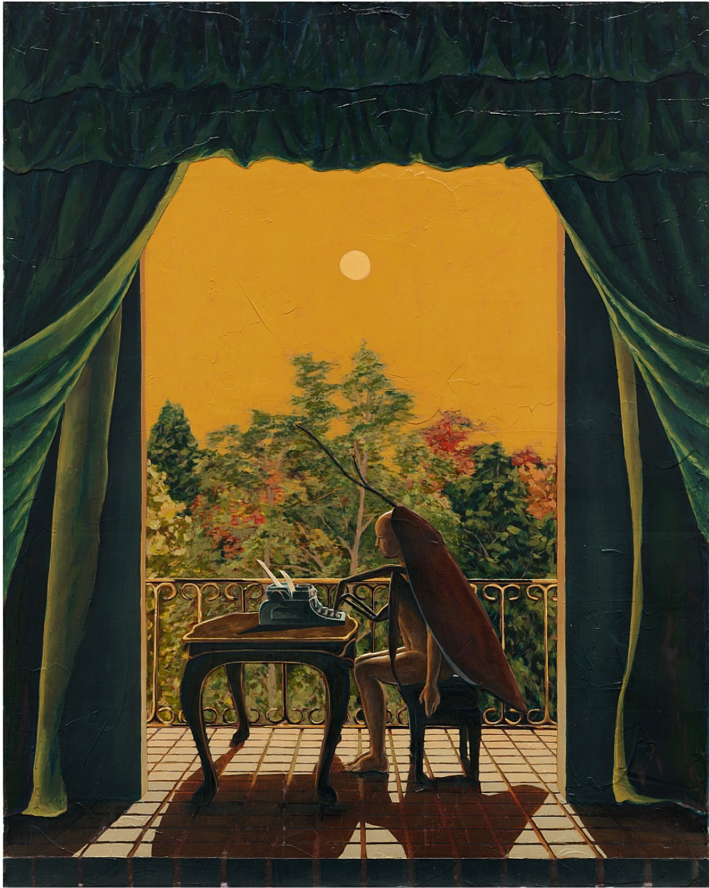
Ho Jae Kim Day 8: Laundry List 2022 Oil, inkjet transfer, enamel, and paper on canvas 50h x 40w in 127h x 101.60w cm