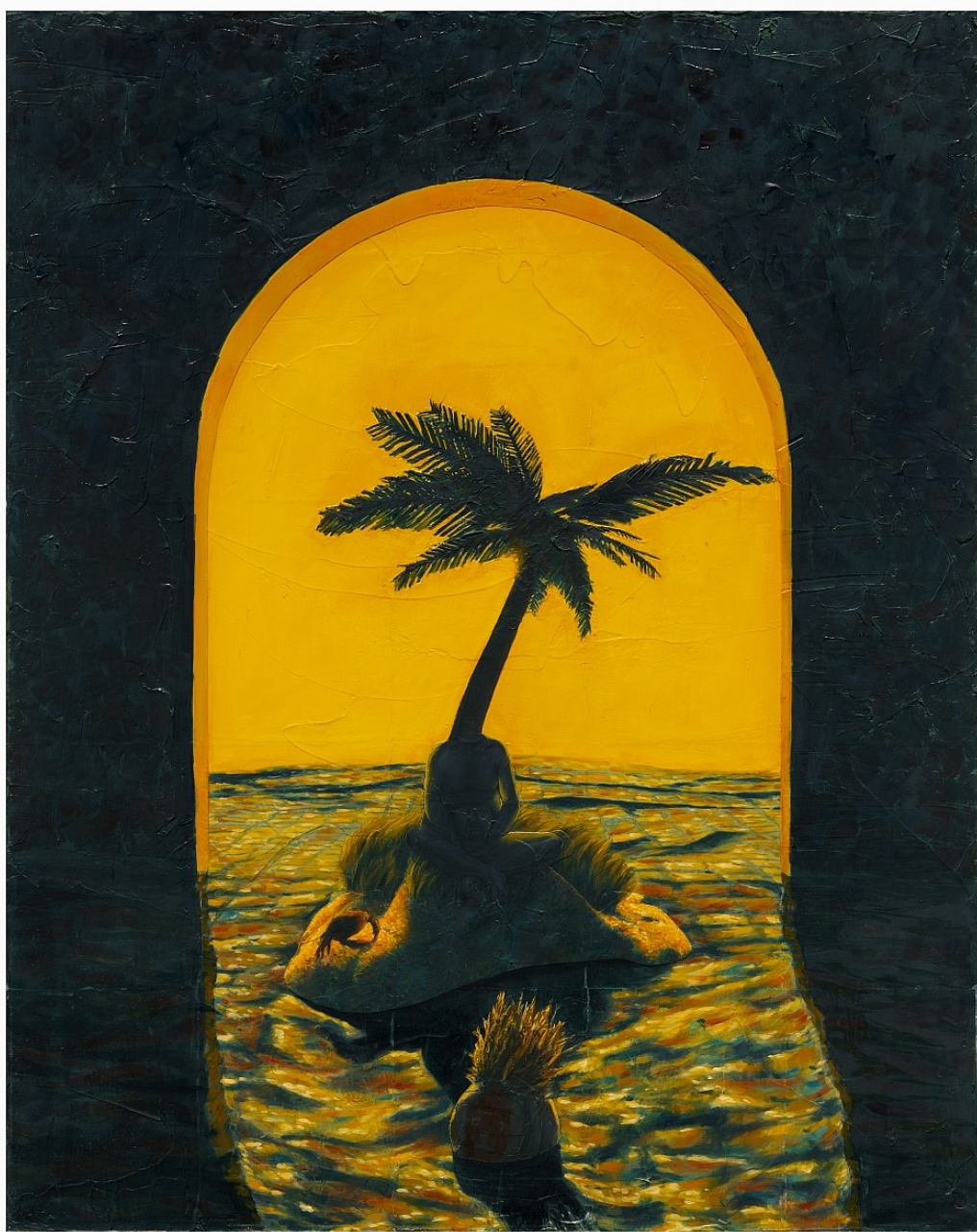
Ho Jae Kim Day 19: Wilson 2023 Oil, inkjet transfer, enamel, and paper on canvas 50h x 40w in 127h x 101.60w cm