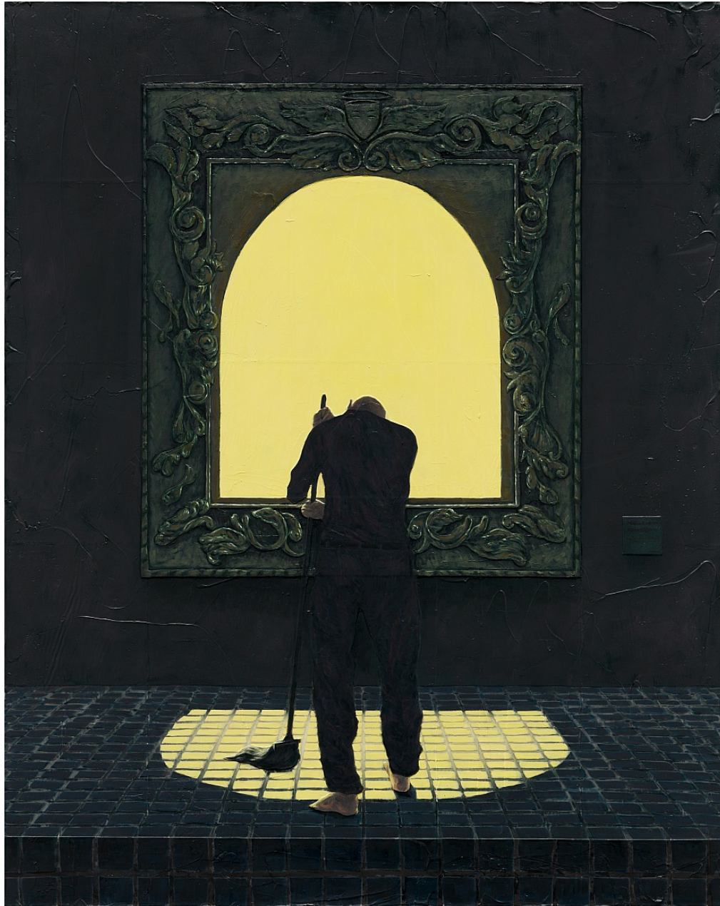
Ho Jae Kim Day 3: Janitor 2022 Oil, inkjet transfer, enamel, and paper on canvas 50h x 40w in 127h x 101.60w cm