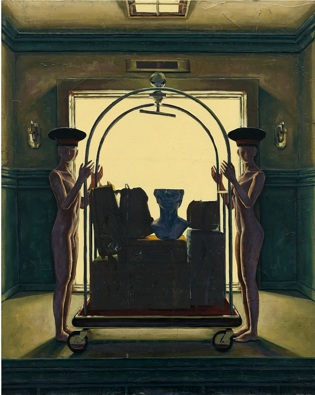
Ho Jae Kim Day 15: Baggage 2023 Oil, inkjet transfer, enamel, and paper on canvas 50h x 40w in 127h x 101.60w cm