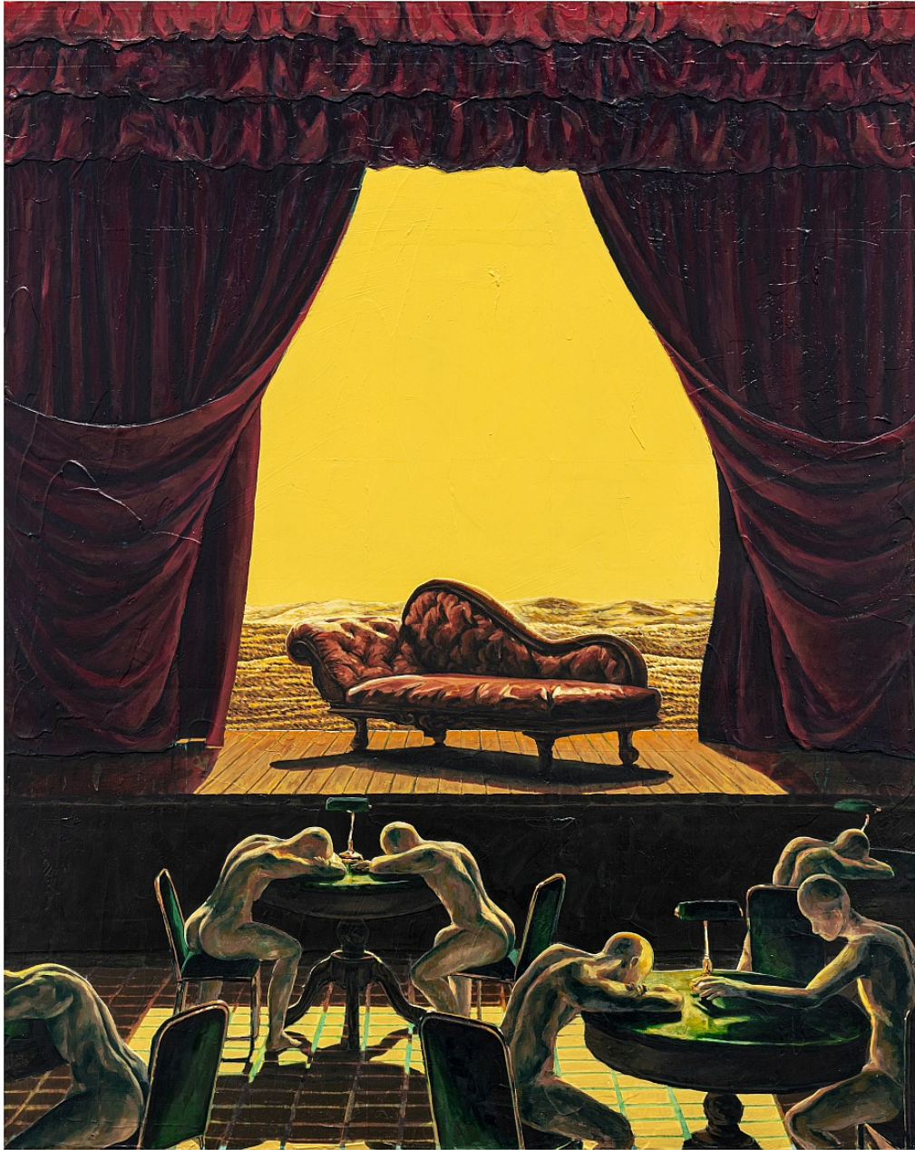
Ho Jae Kim Day 14: Rehearsal 2023 Oil, inkjet transfer, enamel, and paper on canvas 50h x 40w in 127h x 101.60w cm