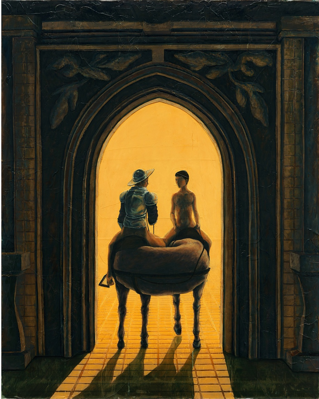
Ho Jae Kim Day 17: Don Quixote 2022 Oil, inkjet transfer, enamel, and paper on canvas 50h x 40w in 127h x 101.60w cm