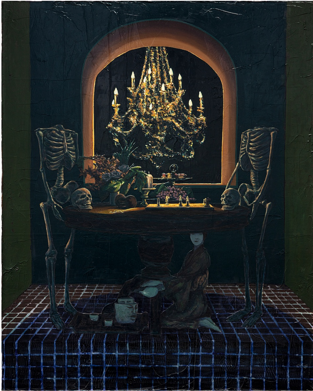
Ho Jae Kim Day 5: In Praise of Shadows 2023 Oil, inkjet transfer, enamel, and paper on canvas 50h x 40w in 127h x 101.60w cm