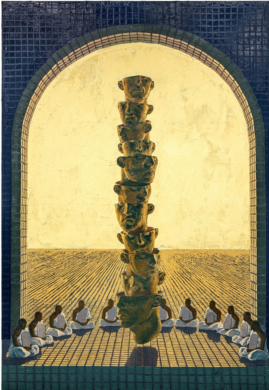
Ho Jae Kim Songs of the Remaining Days 2023 Oil, inkjet transfer, enamel, and paper on canvas 96h x 66.50w in 243.84h x 168.91w cm