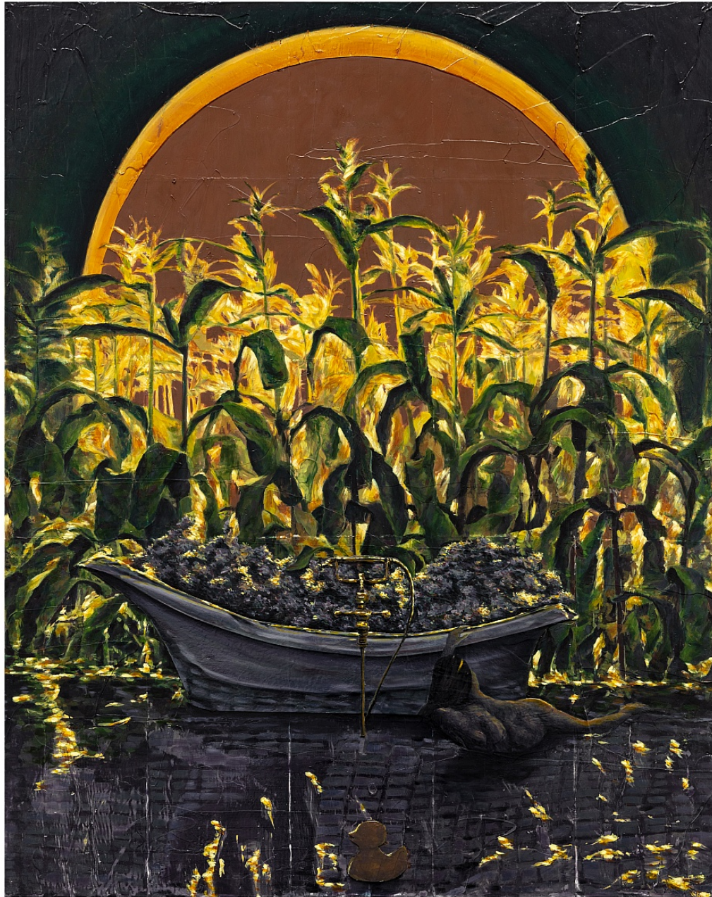
Ho Jae Kim Day 20: Lavender Bath 2023 Oil, inkjet transfer, enamel, and paper on canvas 50h x 40w in 127h x 101.60w cm