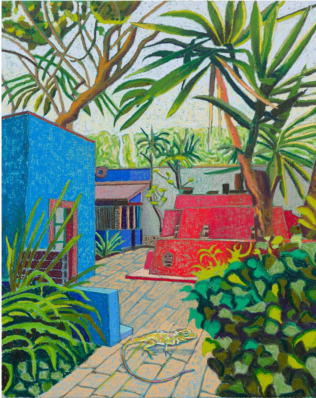
JJ Manford The Garden of Casa Azul 2023 Oil stick, oil pastel, and Flashe on linen 45h x 36w in