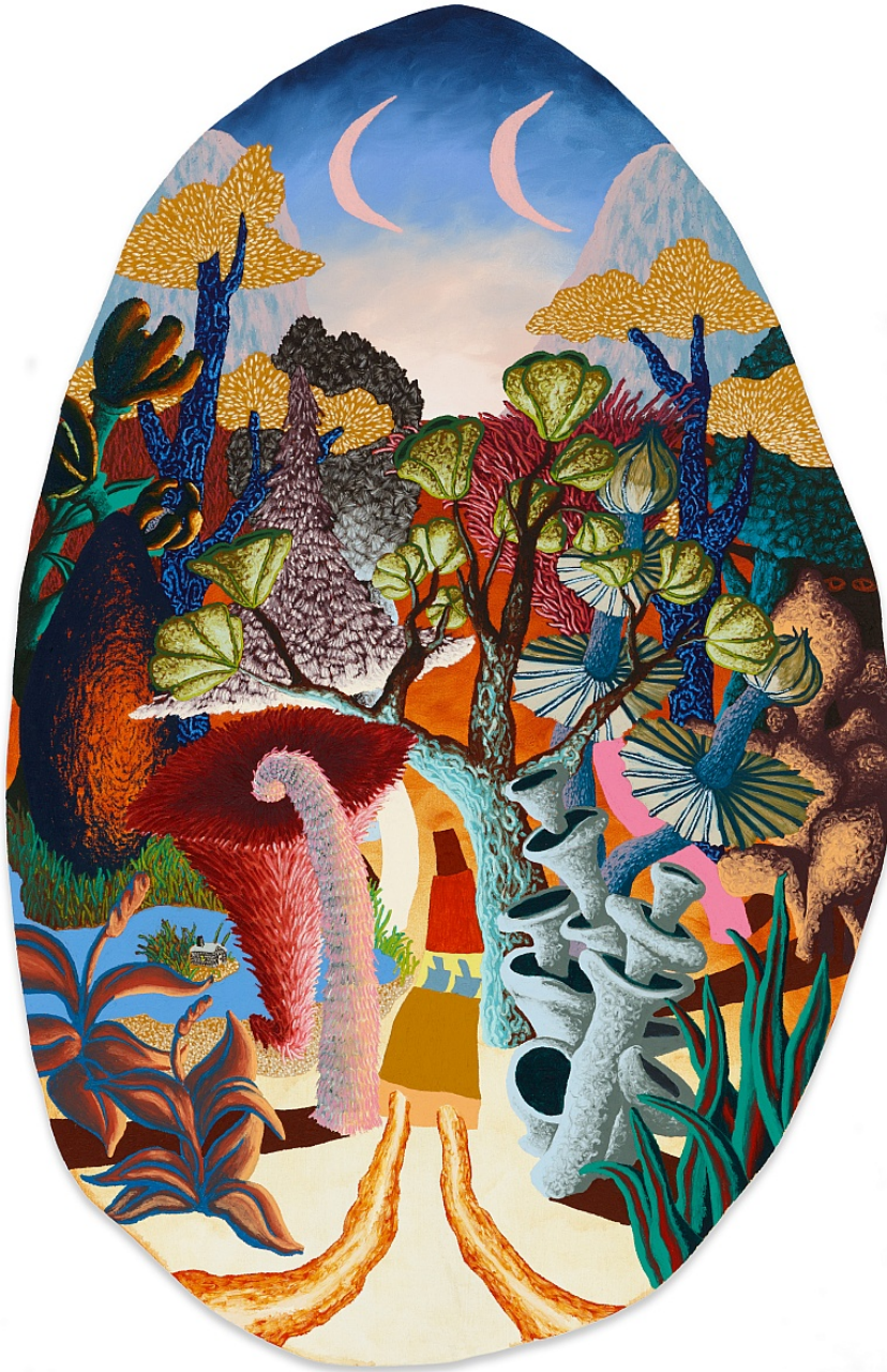
Eliot Greenwald Baby Milk Snake 2023 Oil stick and acrylic on canvas 72.75h x 47w in