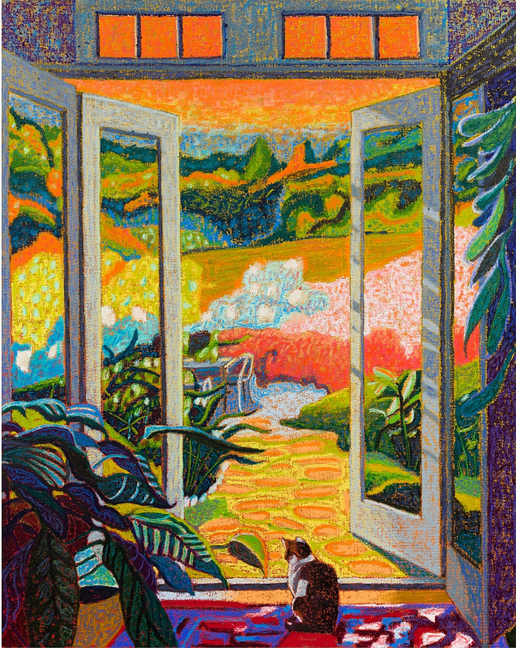
JJ Manford Threshold Painting 2023 Oil stick, oil pastel, and Flashe on burlap over canvas 85h x 68w in