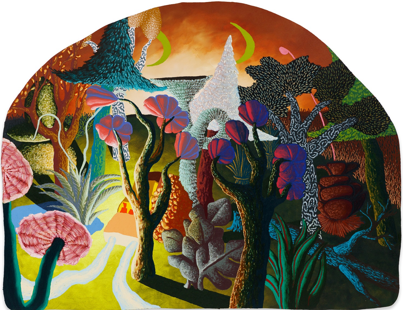
Eliot Greenwald Deer Chow 2023 Oil stick and acrylic on canvas 44.50h x 58w in