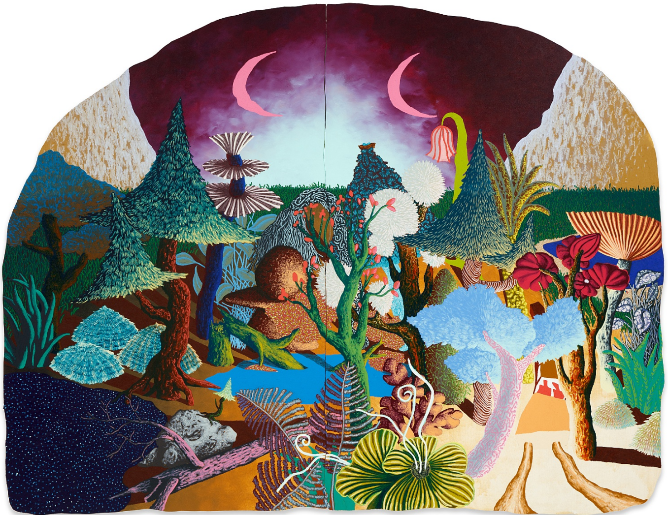
Eliot Greenwald Mahindra 2023 Oil stick and acrylic on canvas Diptych; 71.75h x 93.50w in (altogether)