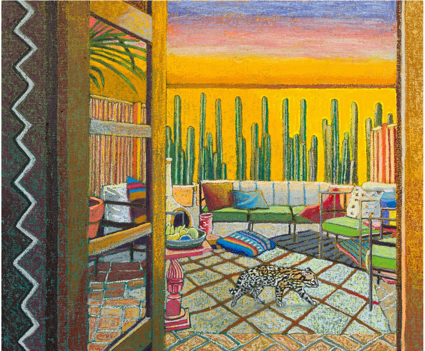
JJ Manford Sunset at Maison Hidalgo with Ocelot 2023 Oil stick, oil pastel, and Flashe on burlap over canvas 50h x 60w in