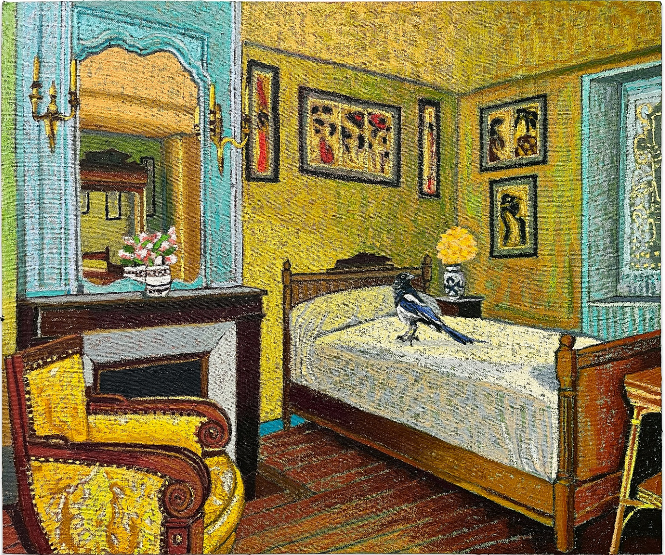
JJ Manford Monet's Bedroom at Giverny 2023 Oil stick, oil pastel and Flashe, on burlap over canvas 50h x 60w in $ 35,000.00