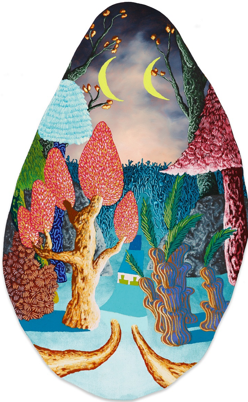
Eliot Greenwald Tree Frog on the Storm Door 2023 Oil stick and acrylic on canvas 47h x 29w in