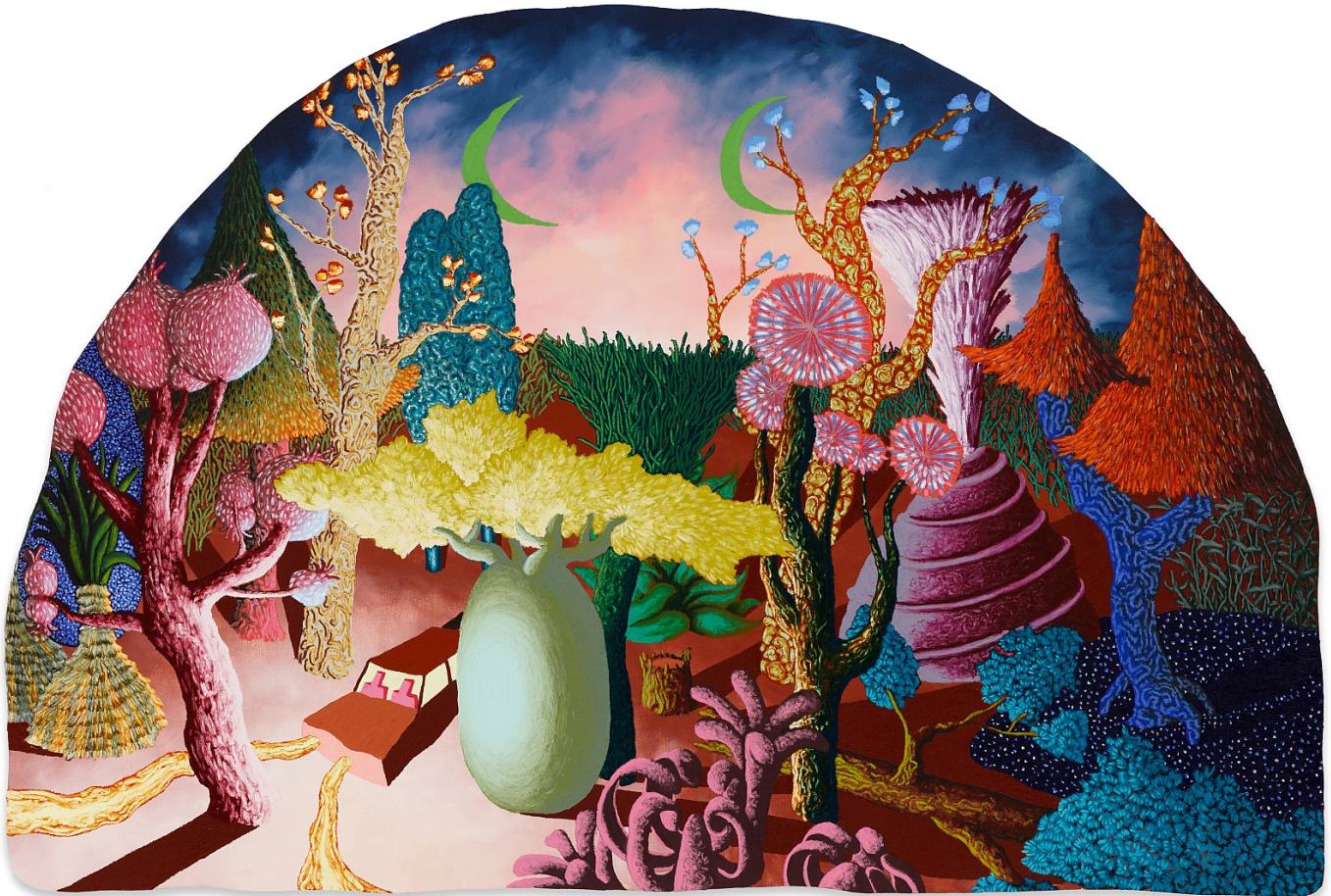
Eliot Greenwald Scarlet Tanager 2023 Oil stick and acrylic on canvas 47.50h x 70w in