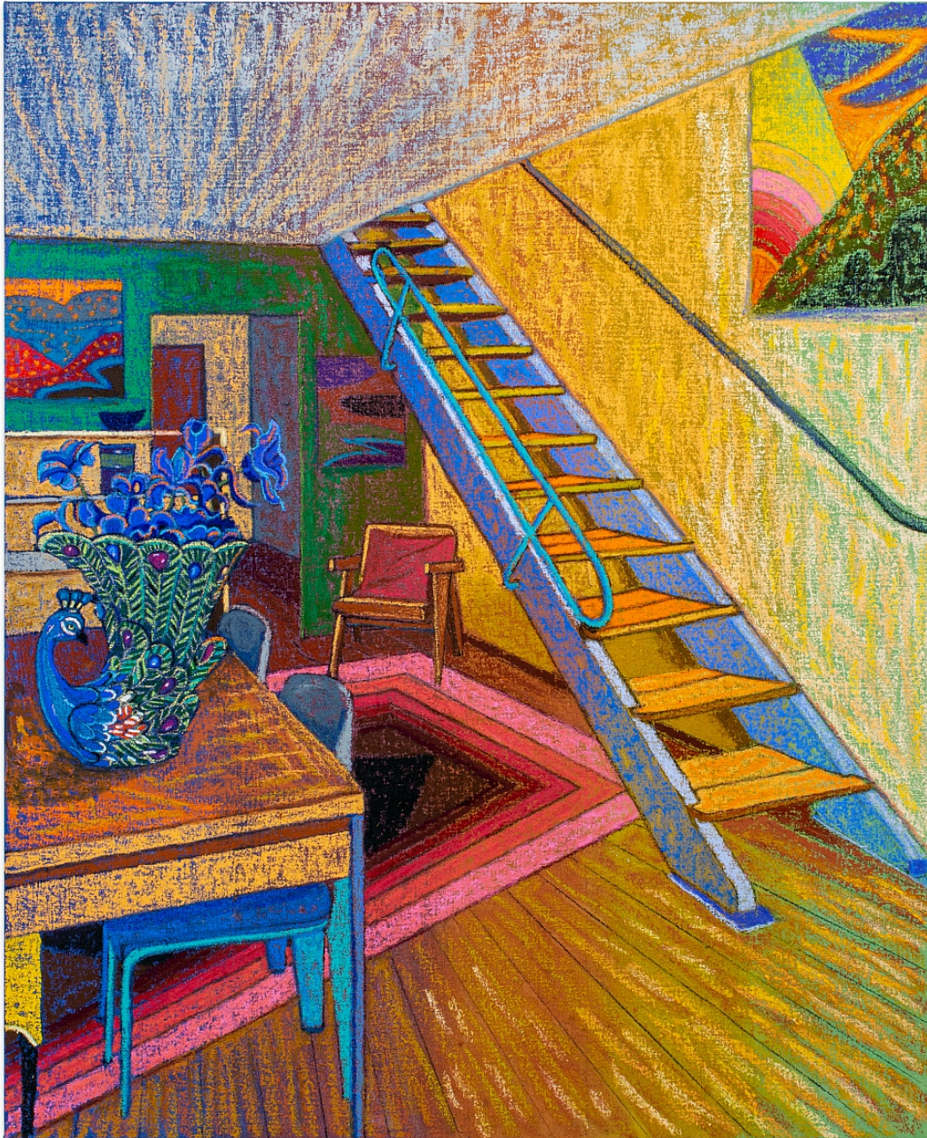
JJ Manford Corbusier Inspired Interior with Peacock Vase 2021 Oil stick, oil pastel, and Flashe on burlap over canvas 84h x 68w in