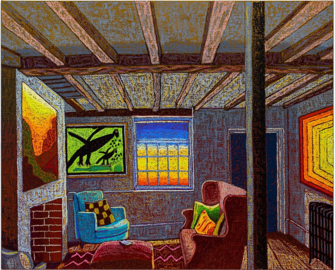
JJ Manford Upstate Interior with Mose Tolliver 2021 Oil stick, pastel, and Flashe on burlap over canvas 68h x 84w in