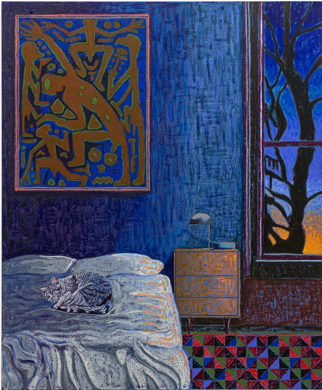
JJ Manford Bedroom with A.R. Penck 2021 Oil stick, pastel, and Flashe on linen 70h x 62w in