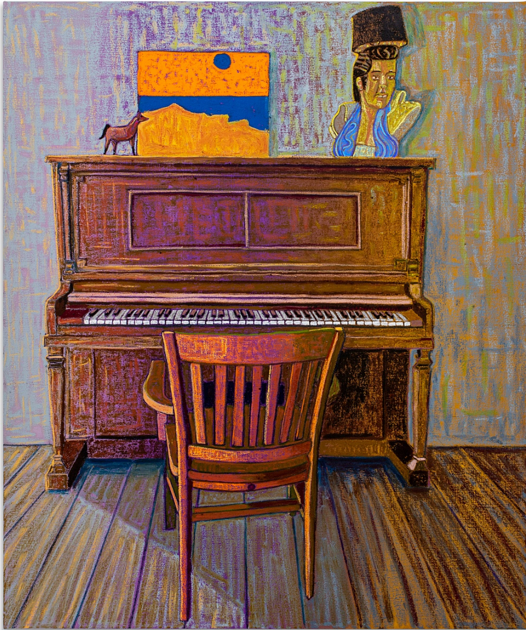
JJ Manford E.M.'s Piano & Elvis Lamp 2021 Oil stick, pastel, and Flashe on linen 70h x 62w in