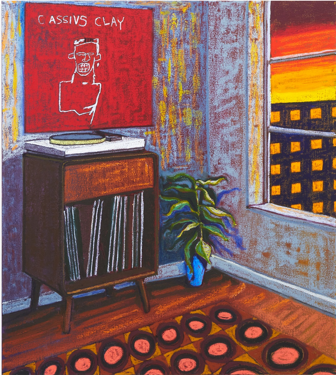
JJ Manford Sunset with Cassius Clay 2022 Oil stick, oil pastel, and Flashe on linen 46h x 41w in