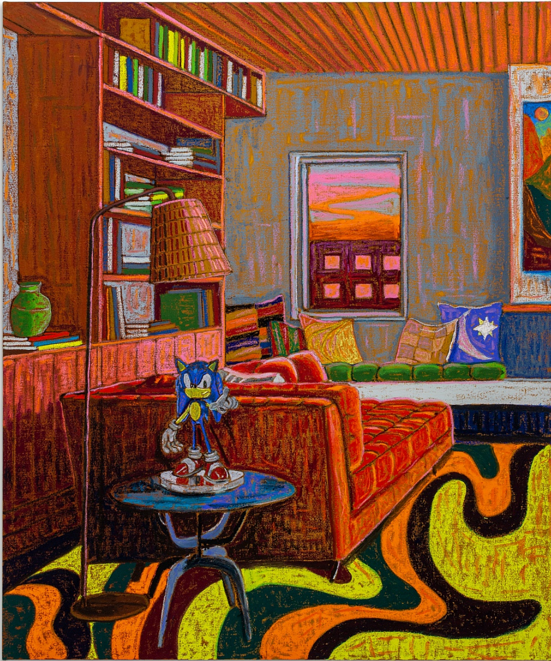
JJ Manford Interior with Sonic & JJ Manford Rug 2021 Oil stick, pastel, and Flashe on linen 72h x 60w in