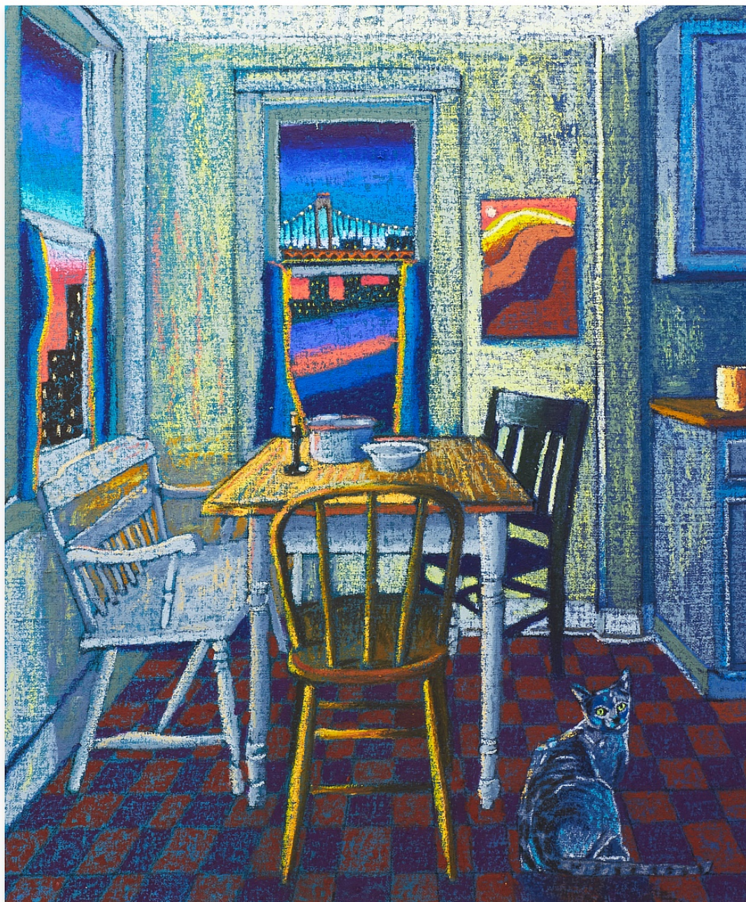
JJ Manford NYC Interior with View of Manhattan Bridge 2022 Oil stick, oil pastel, and Flashe on burlap over canvas 60h x 50w in