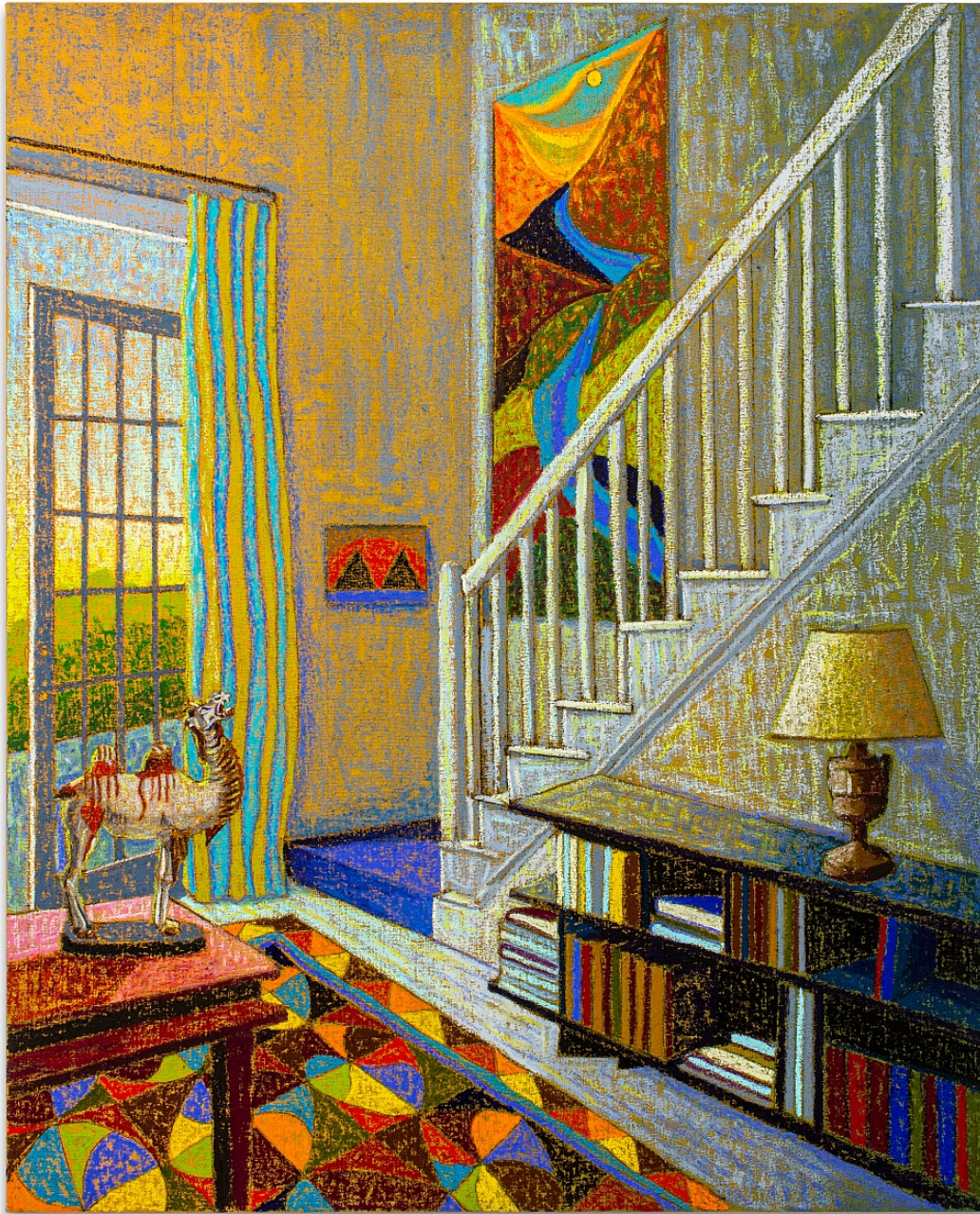
JJ Manford Interior with Bactrian Camel & Visionary Landscape Scroll 2021 Oil stick, pastel, and Flashe on burlap over canvas 84h x 68w in